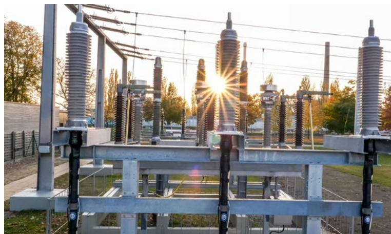
Fast and safe installation, with environmentally friendly technology.